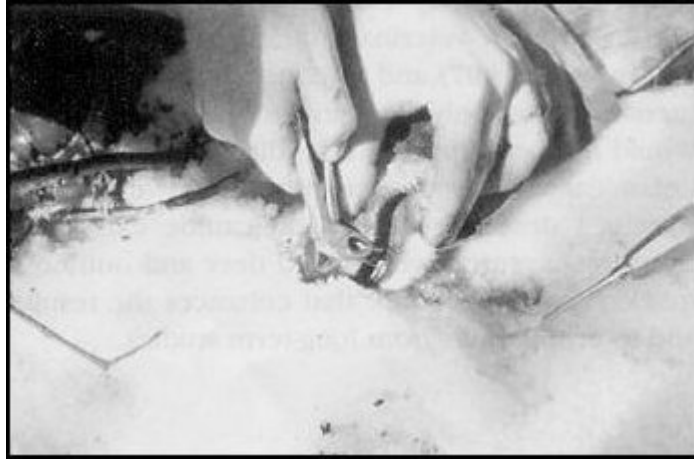
Extracting a canine from an anaesthetized deer by means of a dental elevator (lying on right) and forceps.

Deeper penetration of the elevator and further pressure then nearly complete the process. The objective is to have a very loose, wobbly tooth that can be rotated easily with one's fingers. Finally, I place the dental forceps over the tooth so that the forceps tips are below the gum line. Slow, even, upward pressure then pulls the tooth free from the socket. Sometimes a little additional rotation may be needed. However, the use of much force often results in a broken tooth, indicating that the loosening by the elevator was inadequate. This is a common mistake when learning the procedure. The elevator should be used to almost complete the extraction. If the canine is broken during extraction, I next select the other canine for removal. I have extracted the adjacent incisor (I3) on the rare occasion when first-time operators broke both canines. The procedure, once learned, routinely takes <5 minutes.